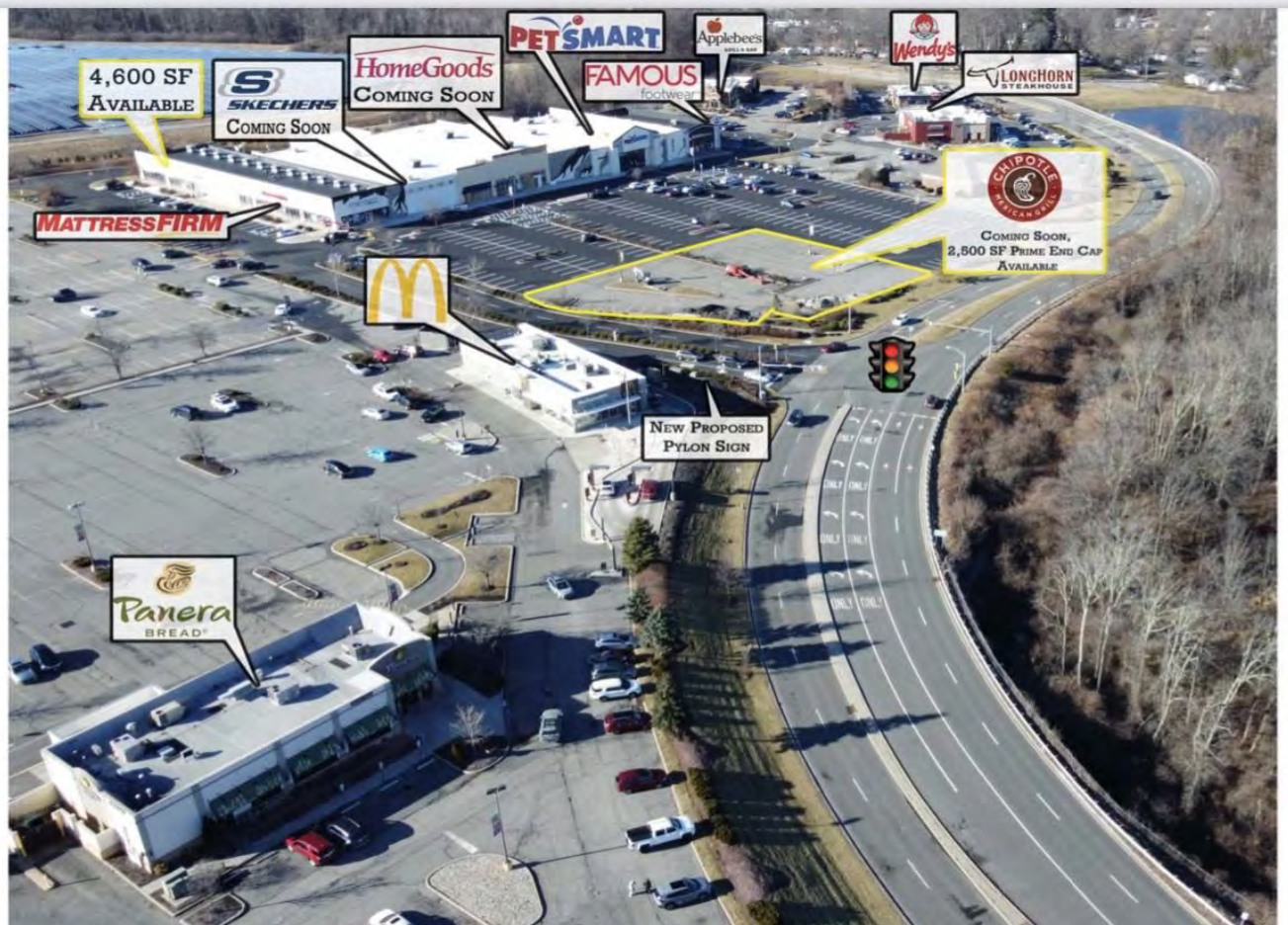
*Aerial view of where the new Sketchers, Chipotle, and Home Good Stores will be located in the ITC Shopping Center South.