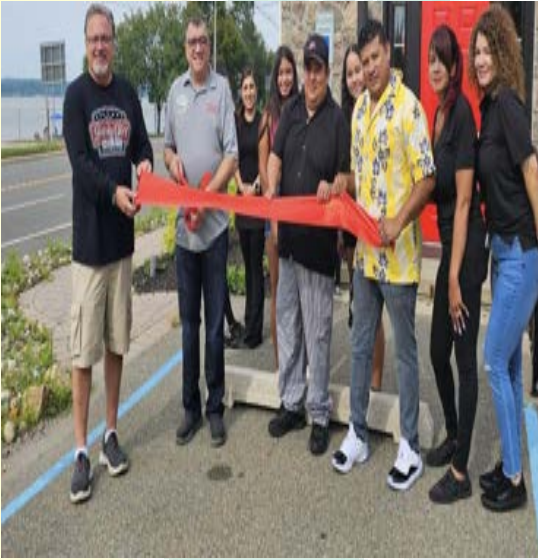
Lakeview Burger and Bourbon Fries

The Economic Development Committee would like to also welcome to Budd Lake the LAKEVIEW Tex-Mex Sports Bar and Grill located at 331 US-46 (formerly Lakeside Tavern).